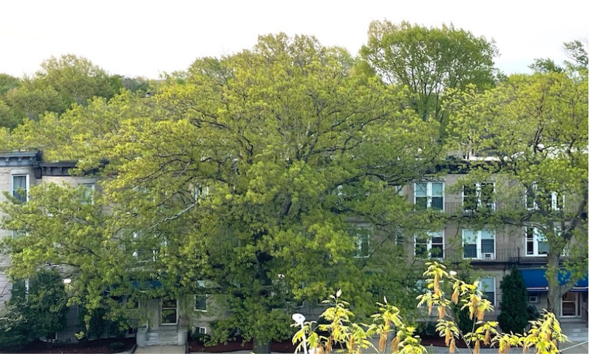
Circular Cities feature green spaces and high density

Circular Cities are more efficient and less costly to run — resulting in lower taxes.