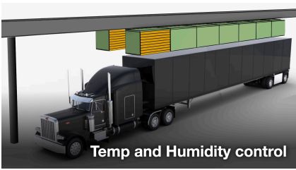
Temp and Humidity control