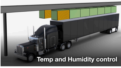
Temp and Humidity control